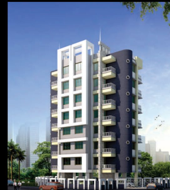
Kohinoor Royal Park Ulhasnagar