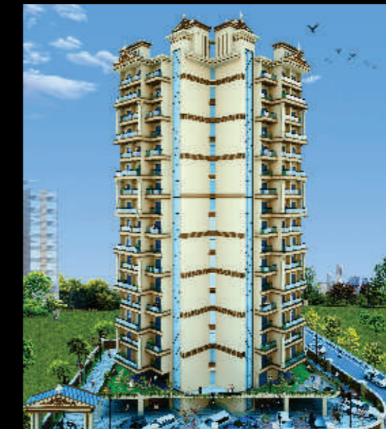
Kohinoor Royale Kharghar, Navi Mumbai