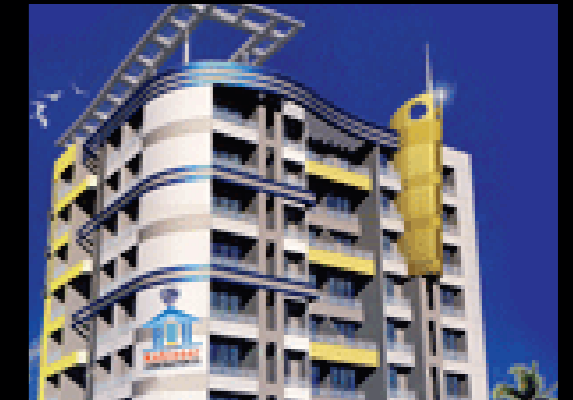
Kohinoor Royal Residency Park Kalyan