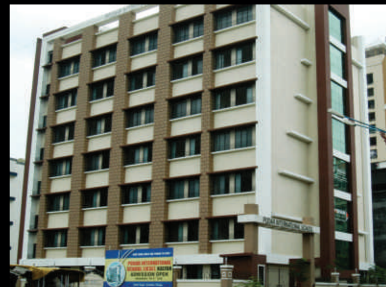
Podar International School