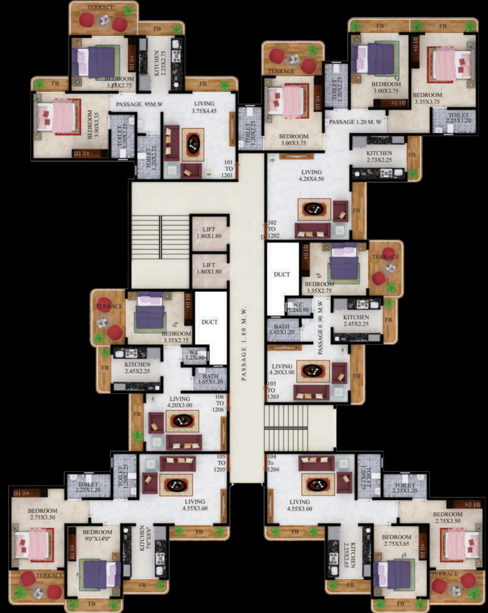
TYPICAL FLOOR PLAN 2, 4, 6, 8, 10 & 12