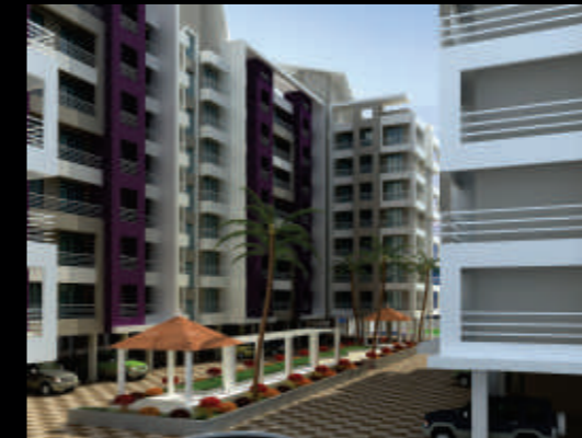
Kohinoor Maxciti Ambarnath

We have been octroi collection agents in Jalgaon for 4 consecutive years between 2006 and 2010. With an ISO 9001:2008 certification to our name, we are geared towards continual improvement in every aspect of our business. In the coming years, we look forward to adapting green-construction methodologies and doing our bit for the environment. Motivated by our past achievements, we are dedicated to transforming the landscape of these regions with world-class projects in future