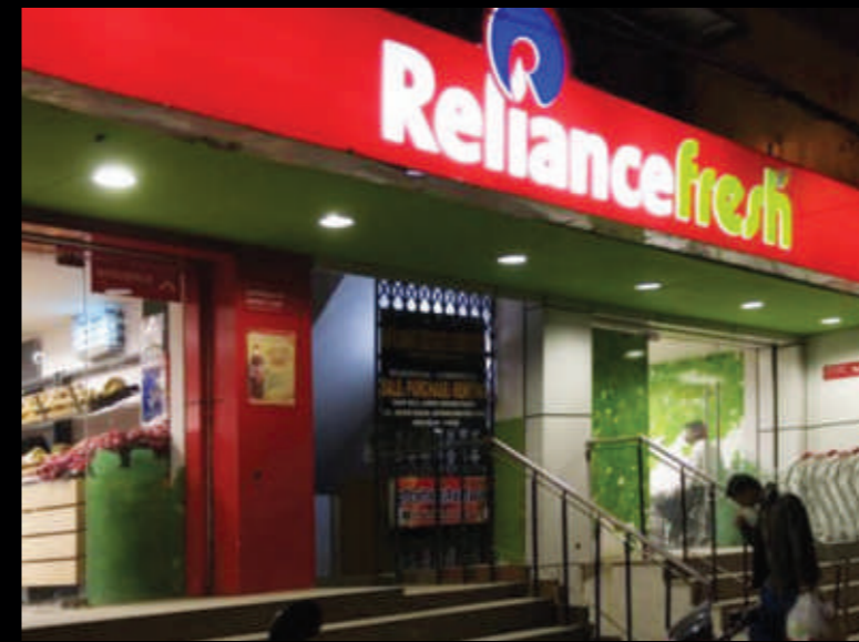
Reliance Fresh Market