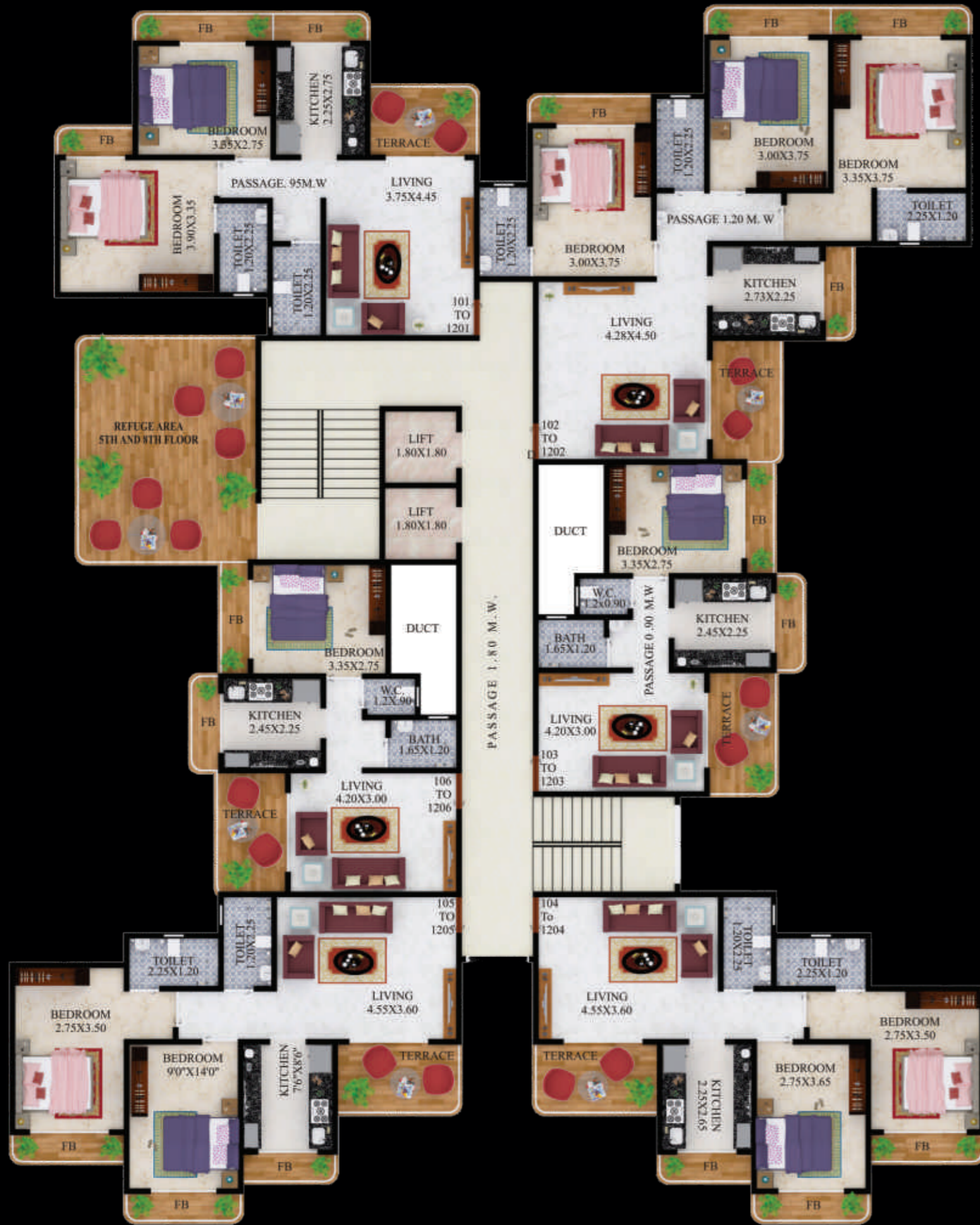
TYPICAL FLOOR PLAN 1, 3, 5, 7, 9 & 11