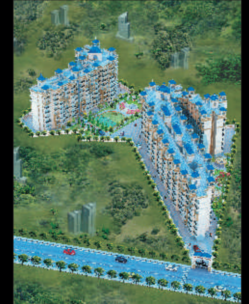
Kohinoor Castles Ambarnath