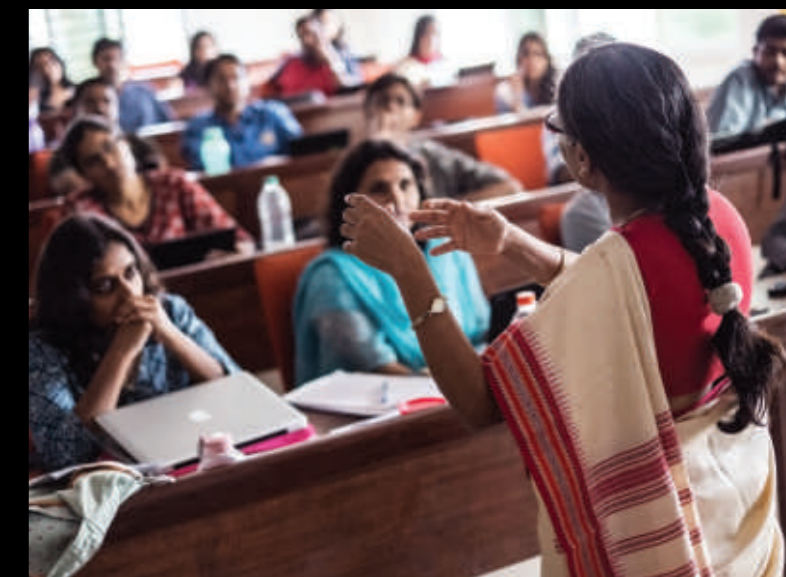
Birla College & School